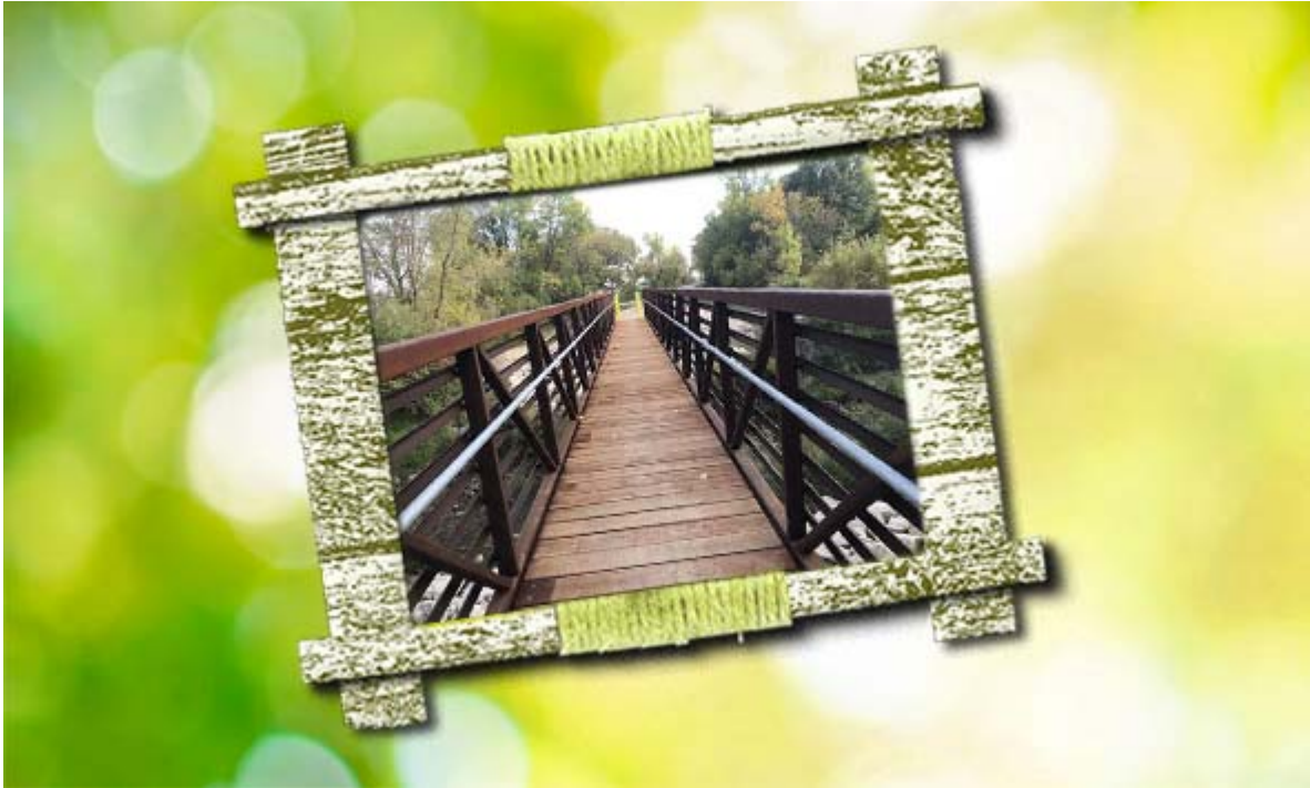
Pont Albert Préfontaine southeast of St-Pierre-Jolys.