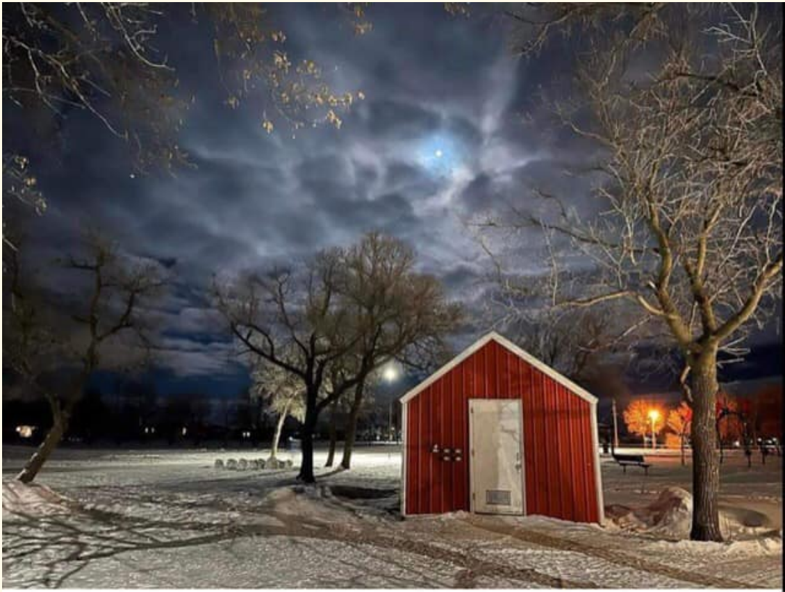
Parc Carillon, St-Pierre-Jolys

This photo was taken on January 16, 2022. Her comments: I was so happy last year when the Village created an ice trail right on the Crow Wing Trail that goes around the park. This year they added lights so we can skate at night. And what a beautiful night this was to be out skating right on the trail!