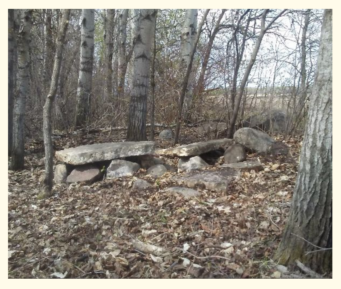
Hard Rock Cafe - Greenridge area