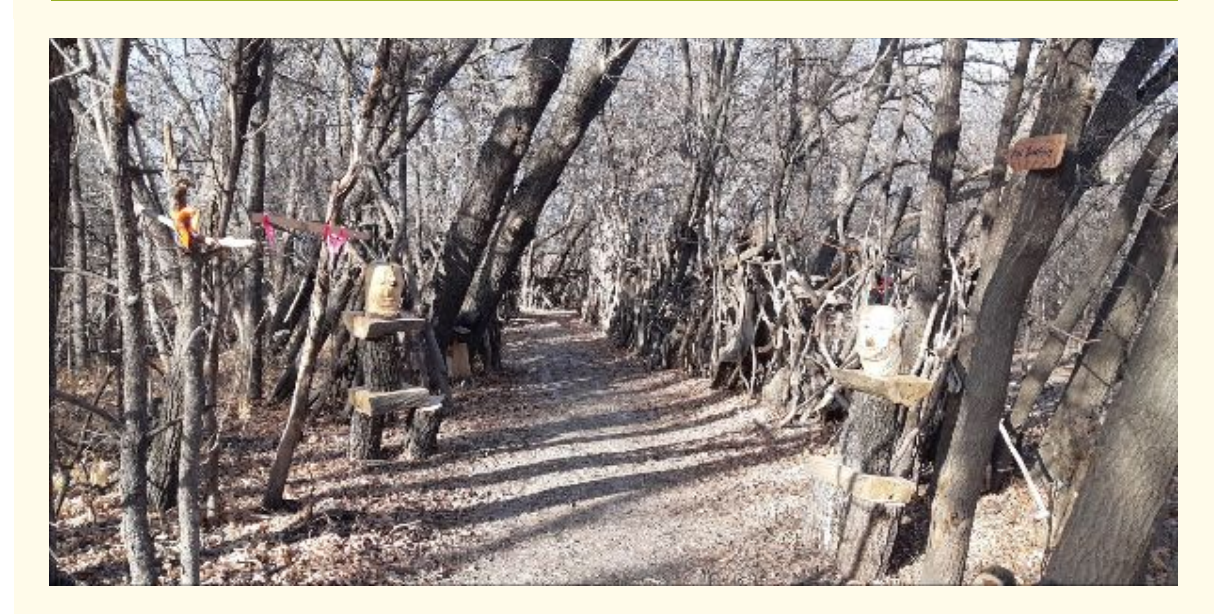
St. Adolphe Friendship Trail Great article on Steinbacholine